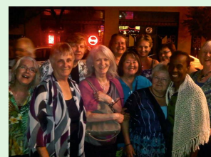
2013 RFI Annual General Meeting Board and Witnesses

In 2013, we created a plan and began. We learned that serving on a Board of a new nonprofit is a very different experience from serving a developed organization. In a start-up organization among other tasks, clarity of vision needs to be discerned; policies created and written; legal issues understood - just to name a few!