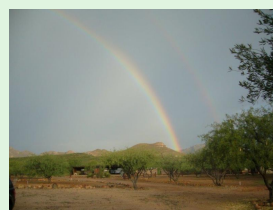
An Invitation into Discovery

During the 2009 OGM Retreat at Kenyon Ranch, a small group of first and second degree students, master candidates, and Reiki masters from around the globe was asked to explore the concept of "Home" for Usui Shiki Ryoho. After their initial conversation, they committed to hold the energy of "home" for one year. This took the form of a monthly Skype meeting.