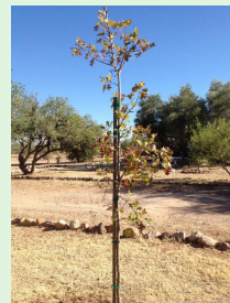
A money tree was planted at Kenyon Ranch to honor the work of the first ED Group in 2013.

As we all know, a new baby needs to be fed, nurtured and loved as it grows into maturity. The same is true for a new nonprofit organization and money is one of the basic food groups!