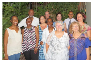
Trinidad Fall Trip

Reiki Home is excited to partner with the Initiatives of Change, Creators of Peace and the Indigenous People of Trinidad and Tobago . You are invited to join us in Trinidad next year.